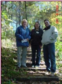
LEARNING ABOUT LOCAL LAND USE ISSUES

Participants will be engaged in learning through 8 full-day sessions and 1 retreat scheduled once a month from September to May. The curriculum for the program is designed to incorporate leadership skill training and discussions within the study of local issues.