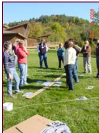
JMVL PARTICIPANTS IN AN ACTIVITY SIMULATING LOCAL GOVERNMENT LAND USE DECISION- MAKING.

“I’ve gained a more solid base of knowledge and understanding of our communities’, counties’, and state’s history and current issues. I feel more empowered to act or speak as I see an opportunity to affect change and become actively involved in my community.”